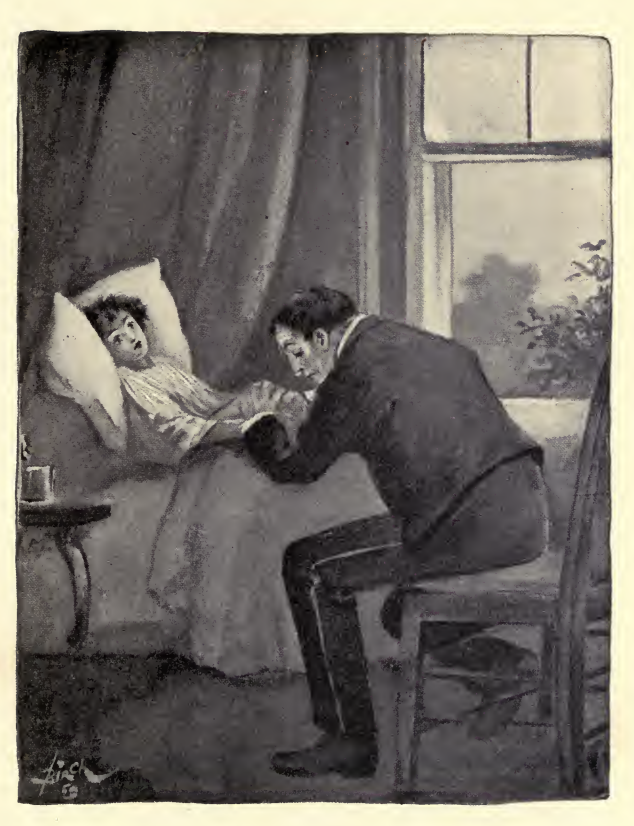
"AND I SHALL ALWAYS BE FOND OF YOU, RABBETT"